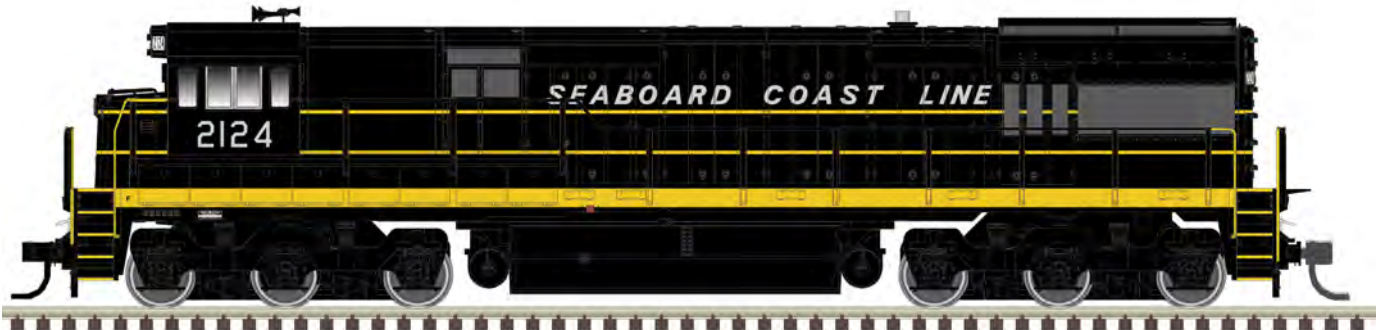
Seaboard Coast Line*