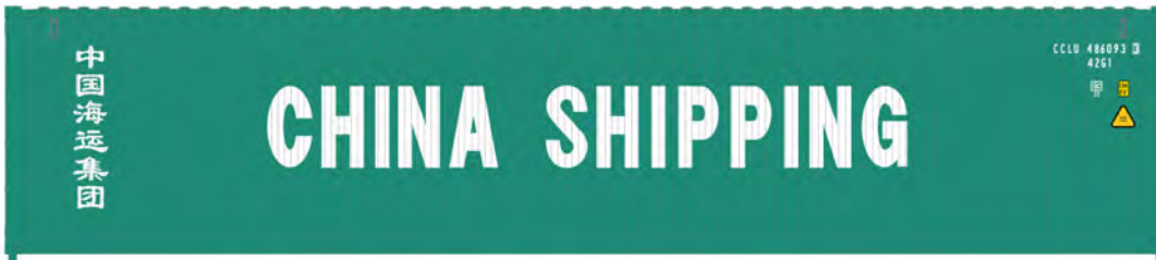
CHINA SHIPPING (CCLU)