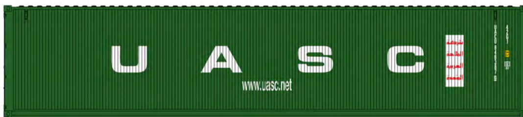
United Arab Shipping Co. (UACU)