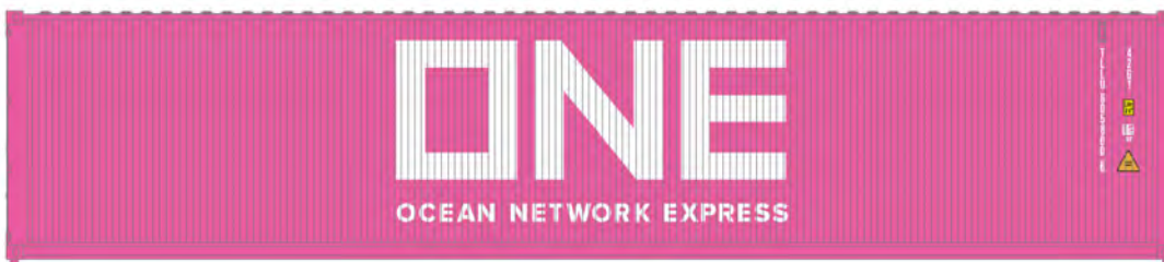
Ocean Network Express (TLLU)