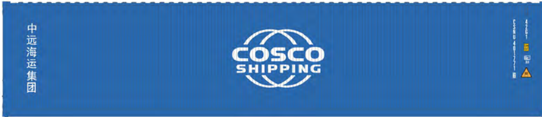
COSCO SHIPPING (CSNU)