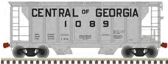
Central of Georgia