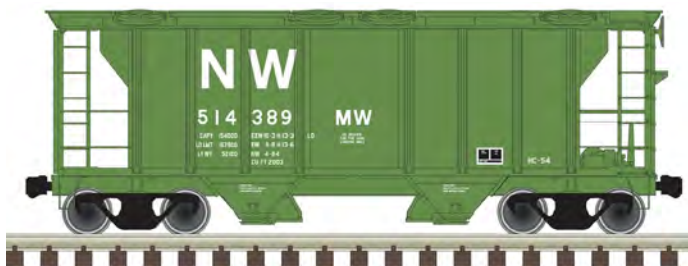
Norfolk & Western