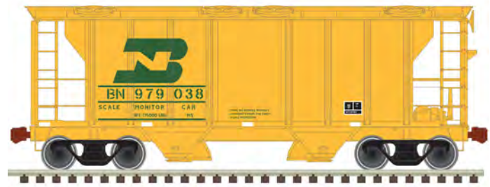
BN Scale Monitor Car