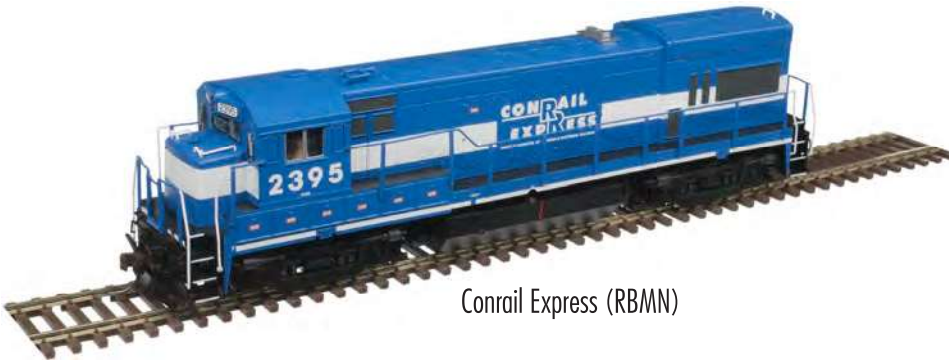
Conrail Express (RBMN)