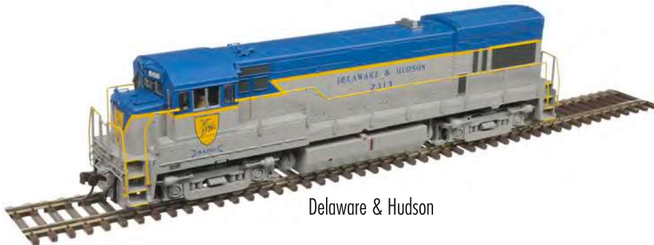
Delaware & Hudson