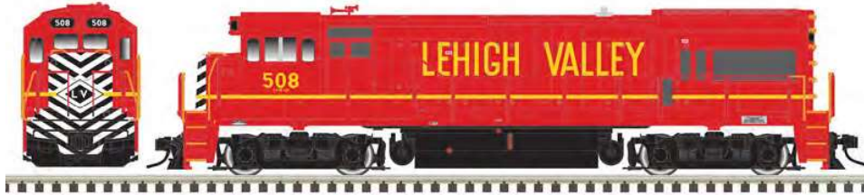
Lehigh Valley (LV herald on nose correct to prototype)