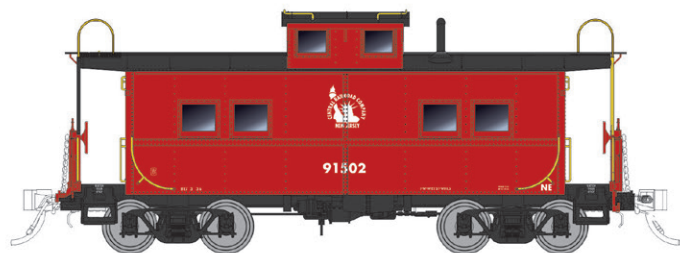
Central RR of New Jersey - Liberty Scheme