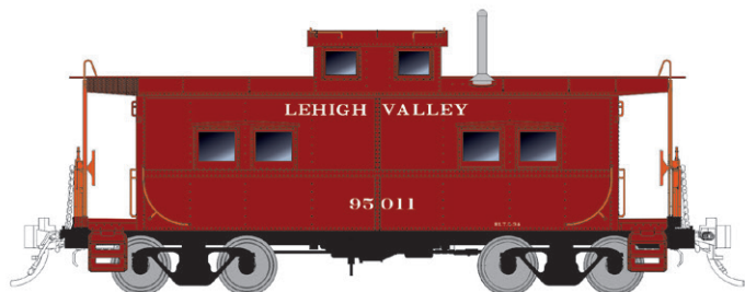
Lehigh Valley - Tuscan