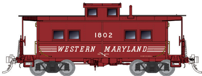
Western Maryland - Speed Lettering