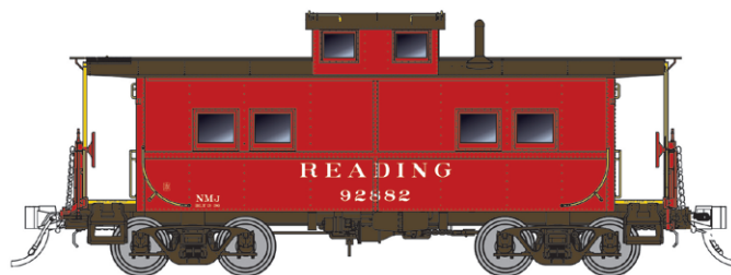
Reading - Red