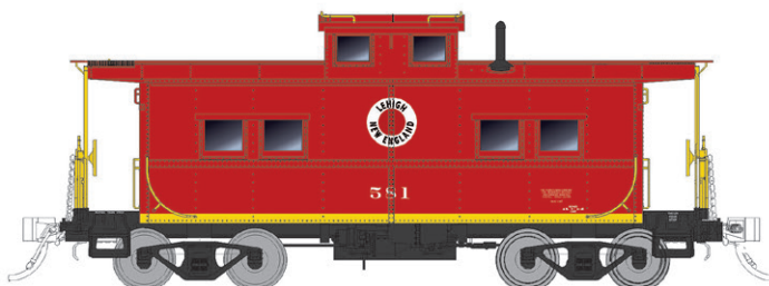
Lehigh & New England