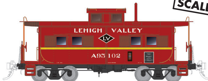
Lehigh Valley - Black Diamond