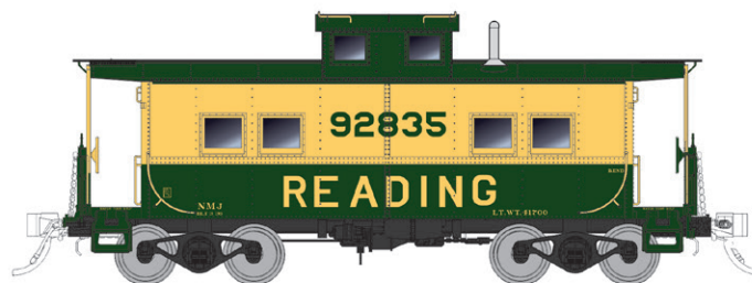
Reading - Green and Yellow