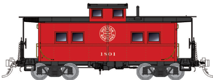
Western Maryland - Fast Freight