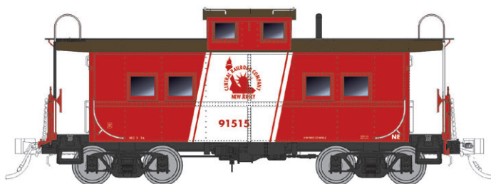
Central RR of New Jersey - Coast Guard scheme