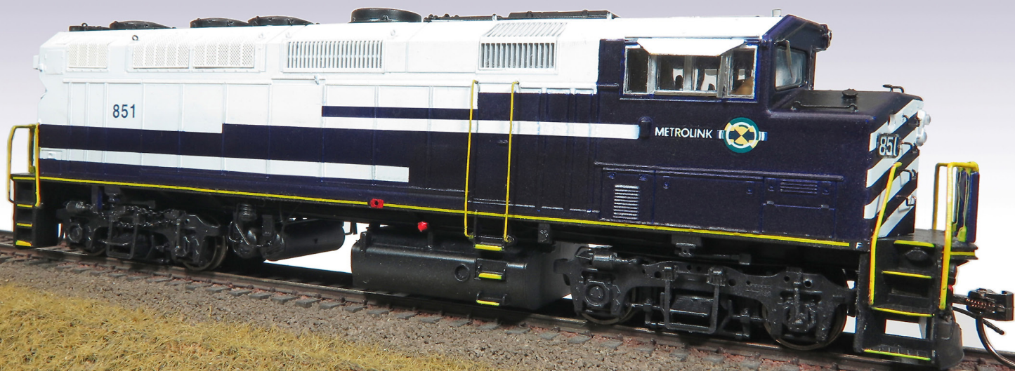
Pre-Production, Hand-painted Sample