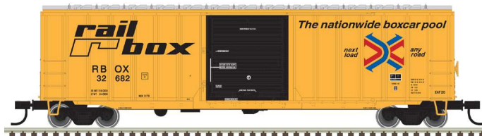
Railbox (Large logo)

+Paint scheme is correct for a car of a similar prototype.