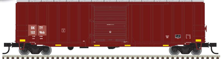
Union Pacific (BKTY)