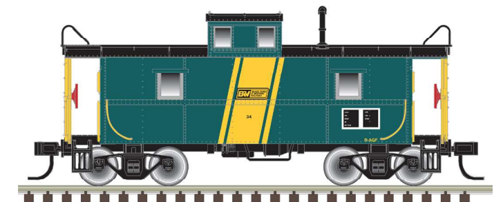
Black River Western