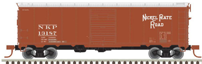
Nickel Plate Road