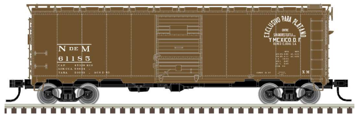
N de M