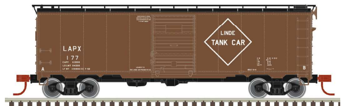
Linde Air Products