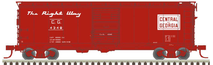
Central of Georgia (The Right Way)