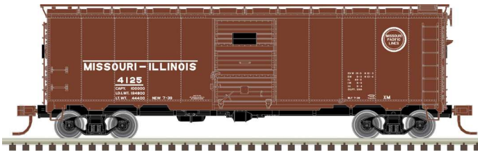
Missouri Pacific (Missouri-Illinois)