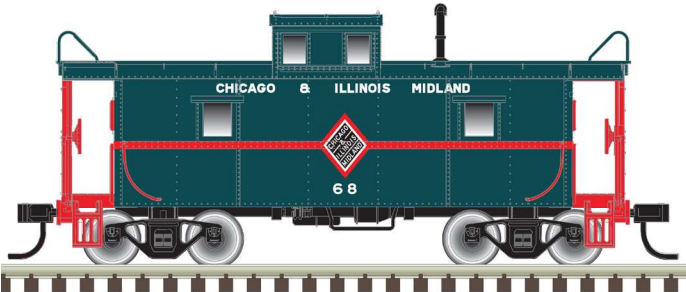
Chicago & Illinois Midland