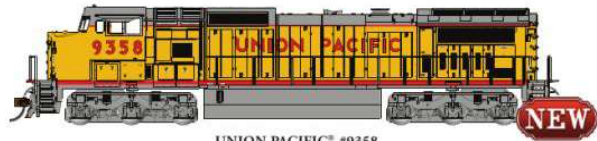
UNION PACIFIC® #9358 Item No. 68514