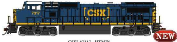
CSX® #7317 - HTM™ (Dark Future) Item No. 68512