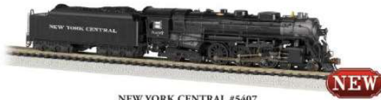
NEW YORK CENTRAL #5407 (as delivered Roman lettering; N scale model shown for illustrative purposes) Item No. 53601