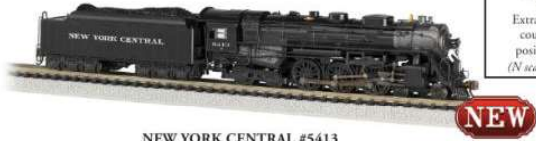
NEW YORK CENTRAL #5413 (as delivered Roman lettering; N scale model shown for illustrative purposes) Item No. 53602