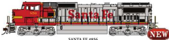
SANTA FE #856 Item No. 68511