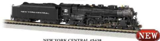
NEW YORK CENTRAL #5438 (Gothic lettering; N scale model shown for illustrative purposes) Item No. 53604