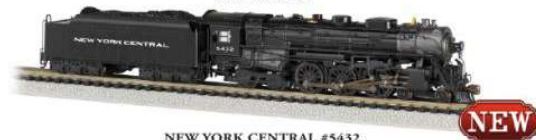
NEW YORK CENTRAL #5432 (Gothic lettering; N scale model shown for illustrative purposes) Item No. 53603