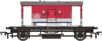
LONDON TRANSPORT #B9550423 Item No. 74903