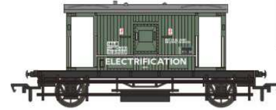
DEPARTMENTAL #LDB952490 (electrification) Item No. 74904