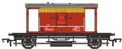
SIGNAL & TELEGRAPH #KDB955094 Item No. 74901