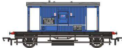
NETWORK SOUTHEAST #ADB955009 Item No. 74902