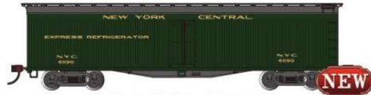
NEW YORK CENTRAL #6090 Item No. 75702

Thanks to the New York Central System Historical Society for providing prototype information