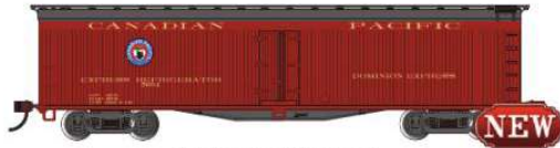
CANADIAN PACIFIC #5604 Item No. 75701