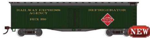
RAILWAY EXPRESS AGENCY #350 Item No. 75704