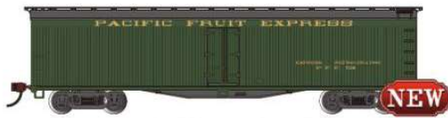
PACIFIC FRUIT EXPRESS #726 Item No. 75703

Thanks to the New York Central System Historical Society for providing prototype information