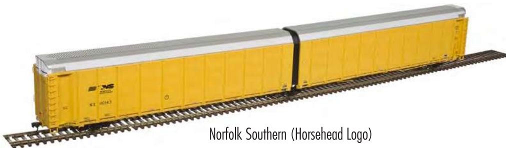
Norfolk Southern (Horsehead Logo)