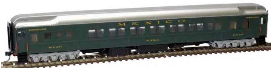
N de M