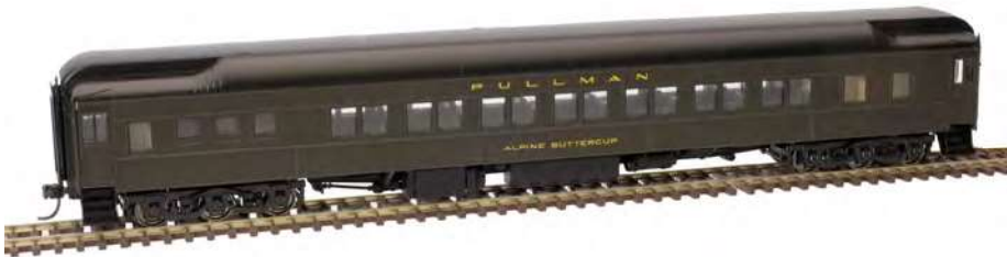
Pullman (assigned UP)