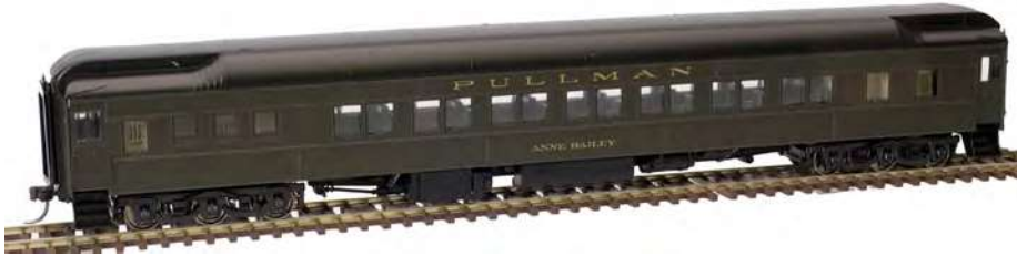
Pullman (assigned C&O*)