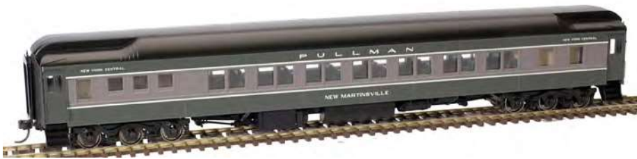
New York Central*