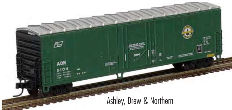
Ashley, Drew & Northern