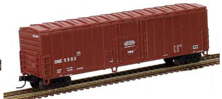
Dakota, Minnesota & Eastern