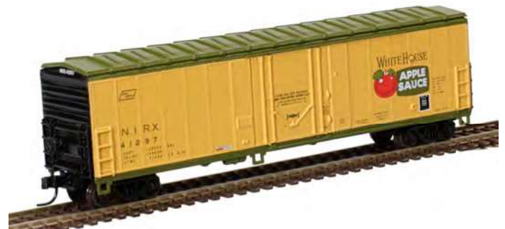
White House (NIRX)