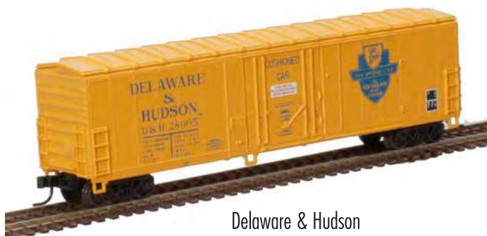
Delaware & Hudson