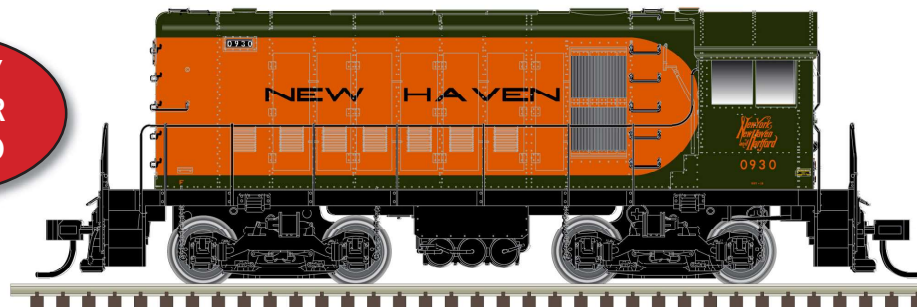
New Haven (Full Balloon)