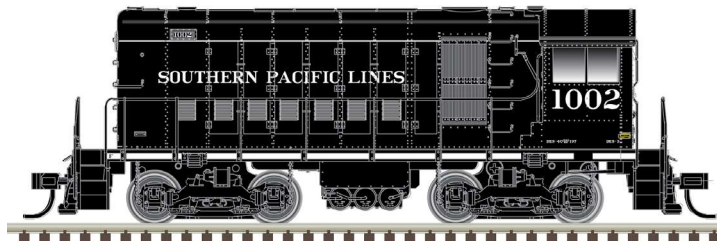
Southern Pacific Lines