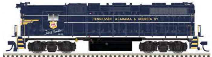
Tennessee, Alabama & Georgia (Tennessee Valley RR Museum) WITH DITCH LIGHTS!

The GP-38 was EMD's lower horsepower, non-turbocharged counterpart to the GP-40. The four-axle GP38 was rated at 2,000 hp and had the advantage of costing less than the GP40. A total of 727 units were produced between 1966 and 1971 when the model was superseded. The wheelbase of the GP38 was identical to that of the GP40. Both units shared the same EMD road-switcher style body that was introduced with the GP35 in 1963. A desire for standardization caused the GP38 to share the same wheelbase, frame and many external components as the GP40. The GP38 was purchased by large and small roads alike. It was routinely found in local and road freight service throughout the US. Many GP38s and 40s are still in service today.