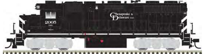
Chesapeake & Delaware WITH DITCH LIGHTS!