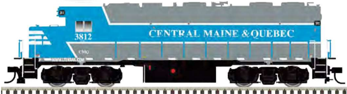
Central Maine & Quebec Railway WITH DITCH LIGHTS!