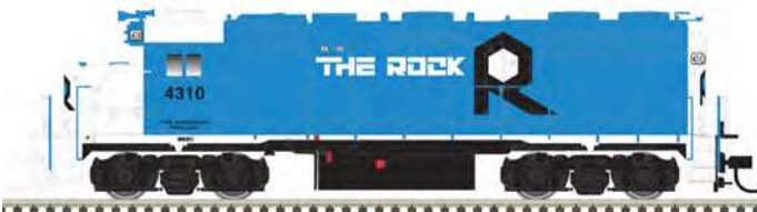
Rock Island Rail WITH DITCH LIGHTS!