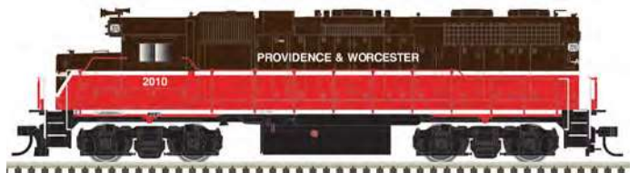
Providence & Worcester WITH DITCH LIGHTS!