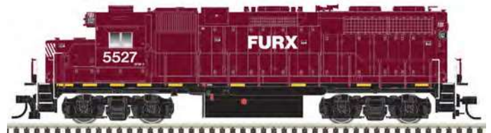
FURX WITH DITCH LIGHTS!