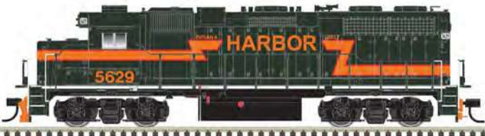
Indiana Harbor Belt WITH DITCH LIGHTS!