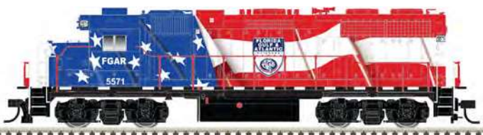
Florida, Gulf & Atlantic WITH DITCH LIGHTS!