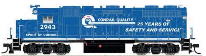
Conrail (Spirit of Conrail) WITH DITCH LIGHTS!