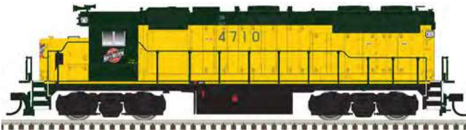
Chicago & North Western