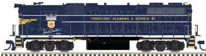
Tennessee, Alabama & Georgia (original)