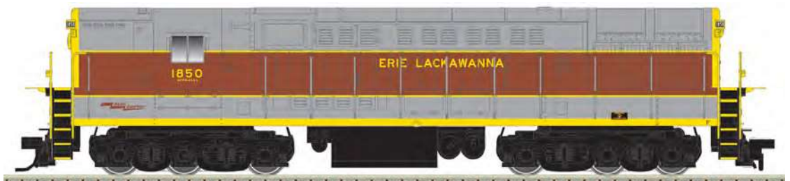
Erie Lackawanna 1850