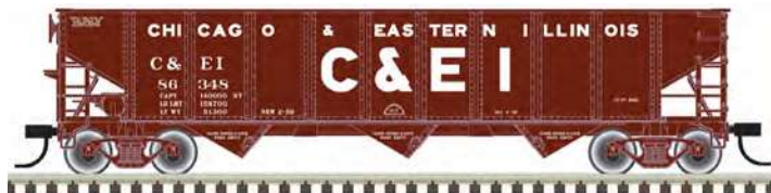
Chicago & Eastern Illinois