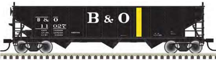
Baltimore & Ohio*