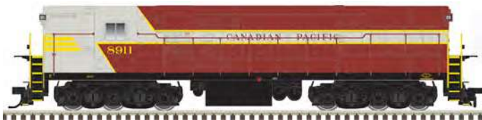
Canadian Pacific (late scheme)