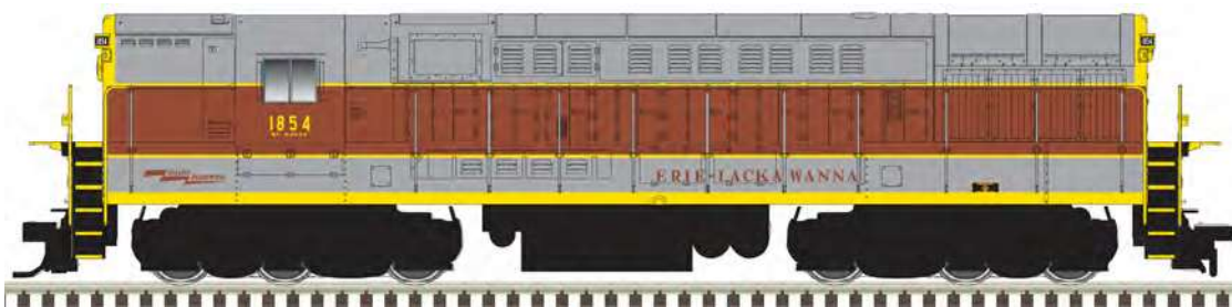
Erie Lackawanna 1854