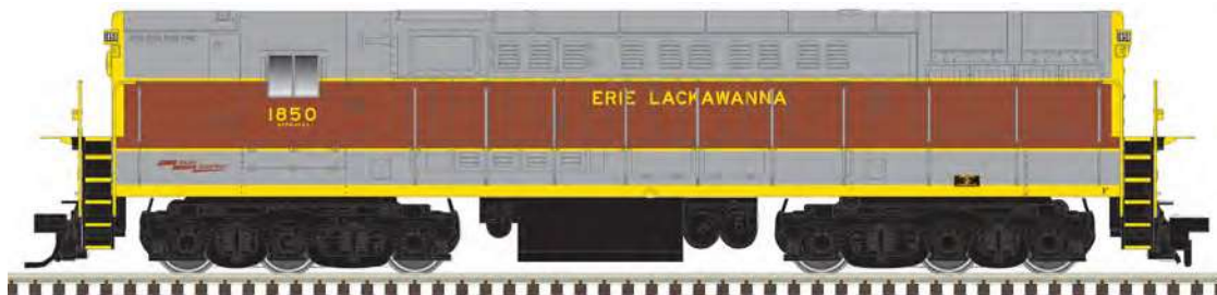
Erie Lackawanna 1850