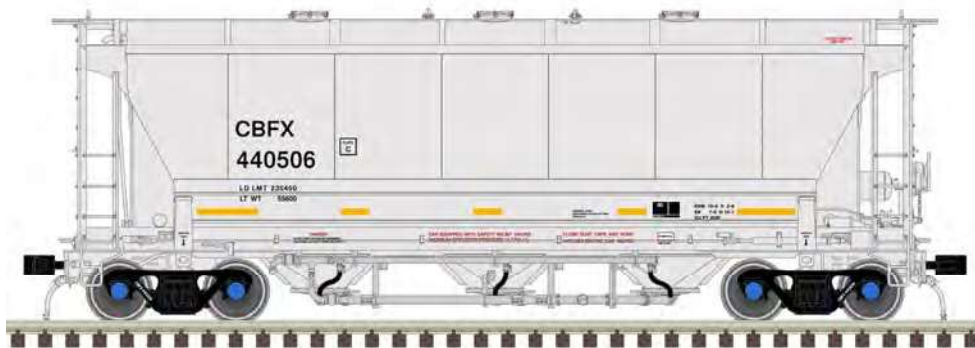
CIT Group (CBFX)