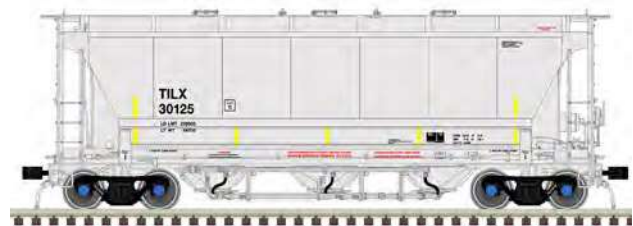
Trinity Industries Leasing (TILX)