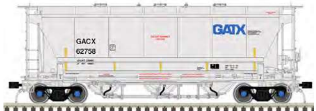
General American (GACX)