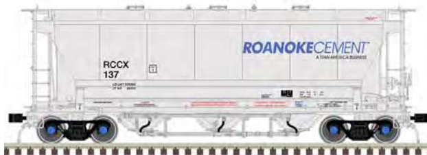
Roanoke Cement (RCCX)