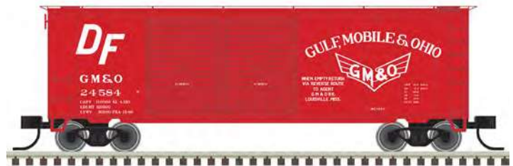
Gulf, Mobile & Ohio