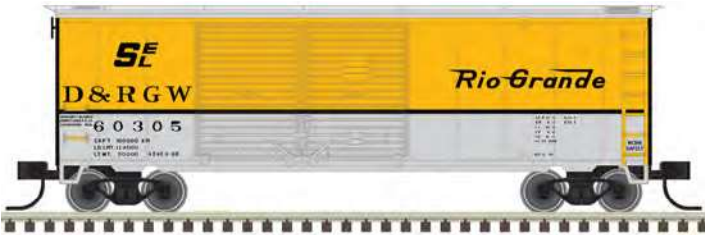
Denver, Rio Grande & Western