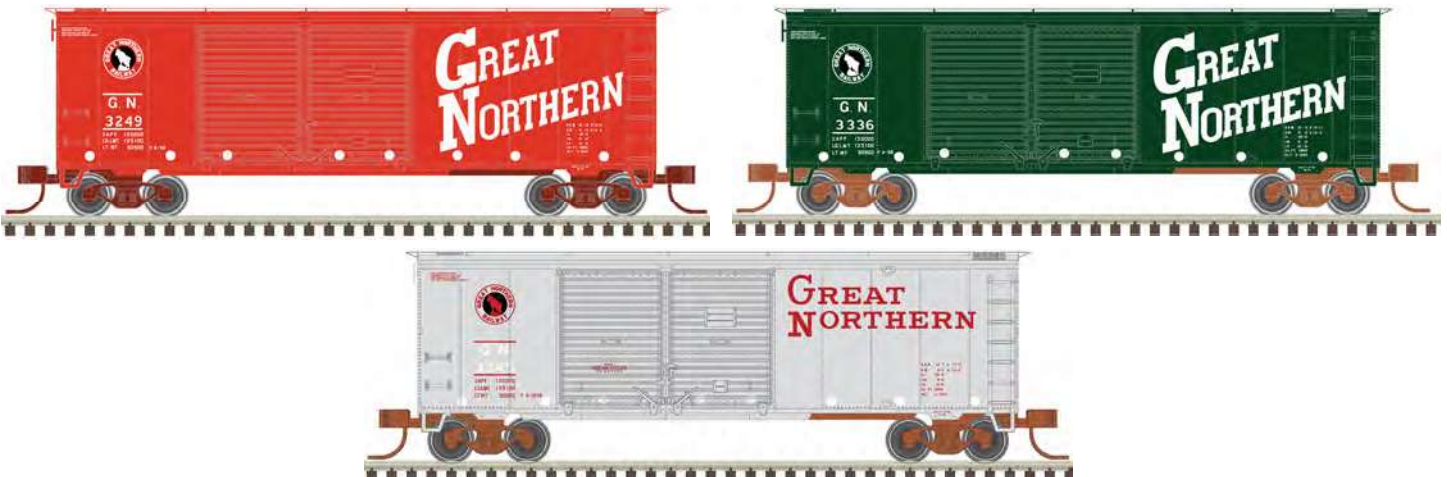
Great Northern Experimental Schemes 3-Pack

AccuMate® couplers are made under license from AccuRail, Inc.