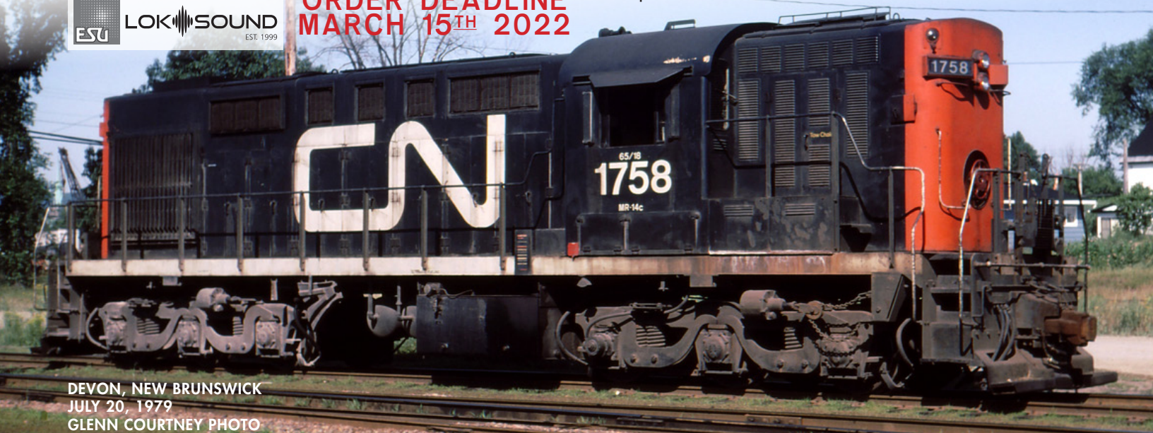
DEVON, NEW BRUNSWICK JULY 20, 1979