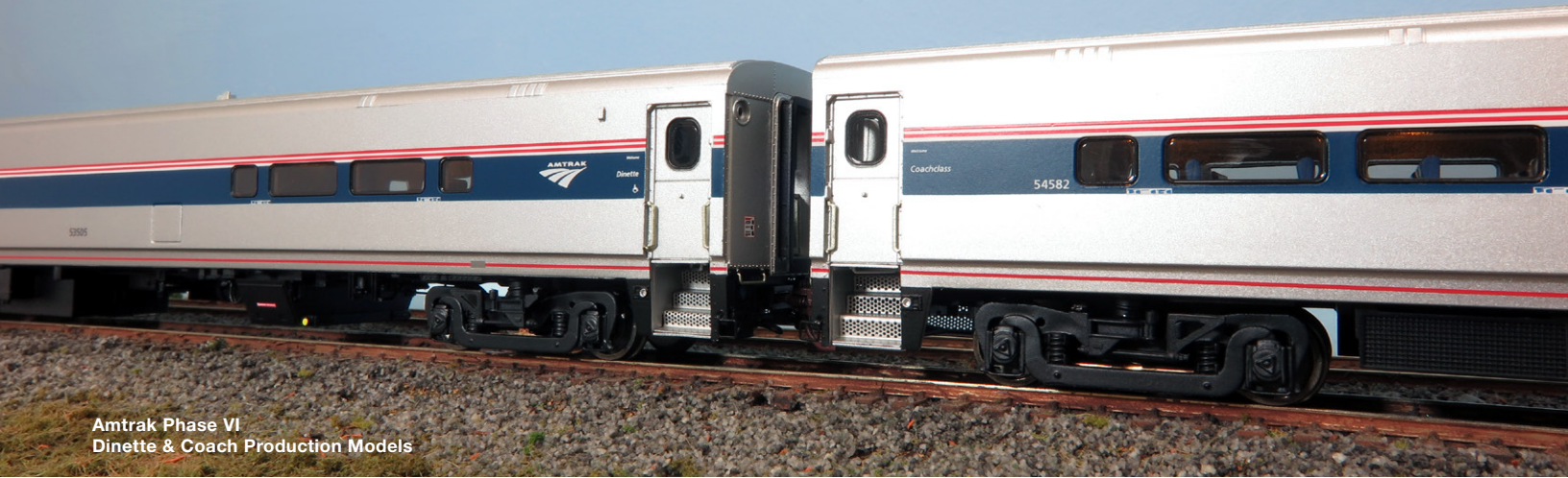
Amtrak Phase VI Dinette & Coach Production Models

Introduced by Amtrak in April 1989, the Horizon fleet (initially known as the Amfleet IIIs) were based on the Pullman-Standard Comet-series commuter cars built since 1970. The new Horizon fleet consisted predominantly of two basic car types - Coach and Dinette - with 86 and 18 cars respectively forming the 104-car order placed with Bombardier.