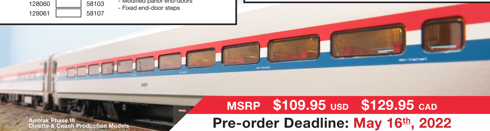
Amtrak Phase III Dinette & Coach Production Models