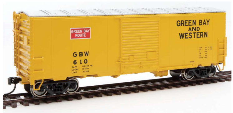
Green Bay & Western