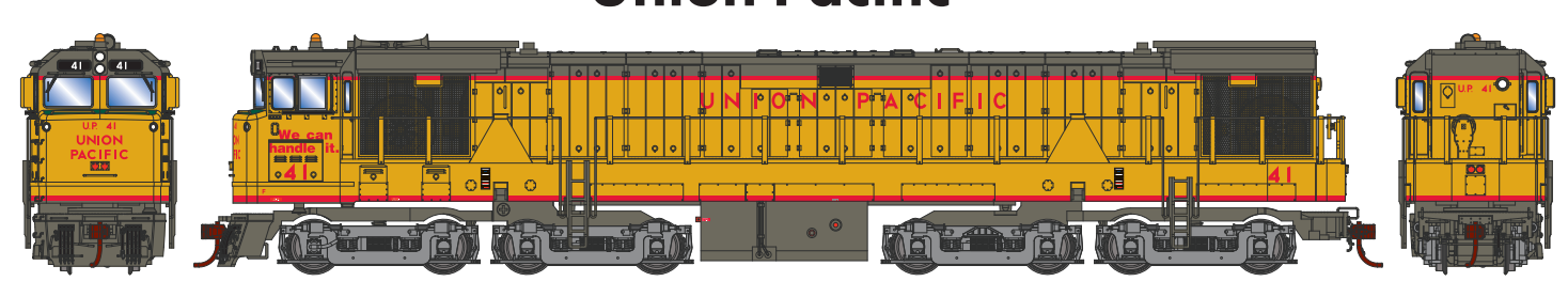
Era: Early 1970's