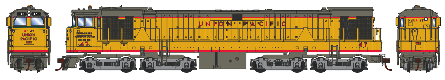
Era: Late 1960's - Early 1970's