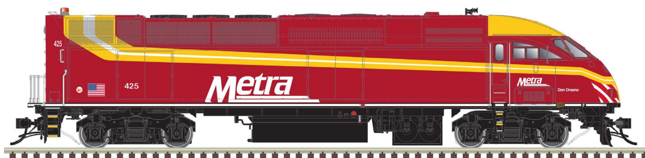
Metra - Rock Island Heritage

"Metra" and "Metra Metropolitan Rail" are registered servicemarks of Metra.