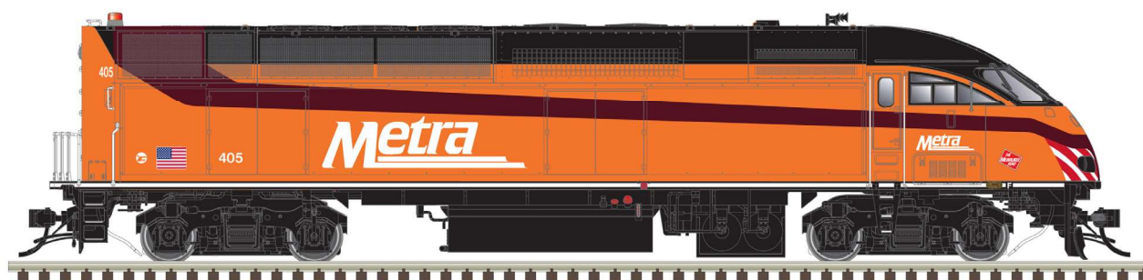
Metra - Milwaukee Road Hiawatha