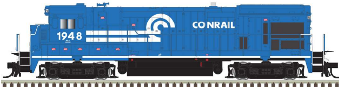
Conrail (white sill)