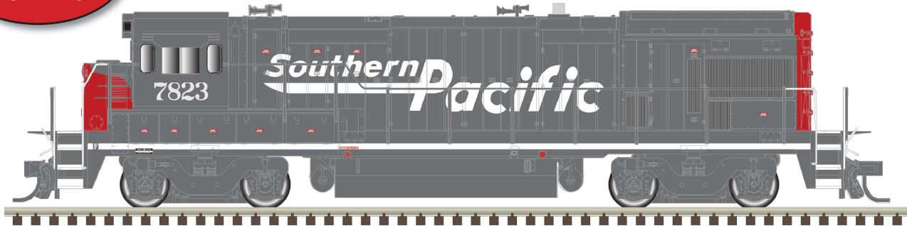
Southern Pacific (speed lettering)