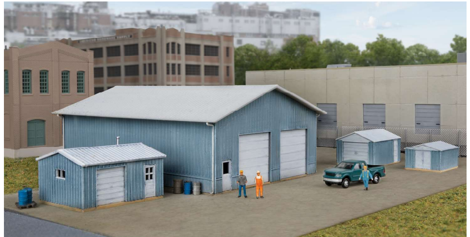
Figures, vehicles, and scenery items not included.