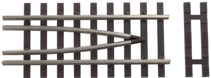
Code 100 Bridge Track End Set 948-10005