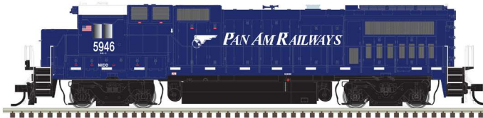
Pan Am (MEC) (front and rear ditch lights)

Dash 8-40B models now with ditch lights as appropriate per road name!