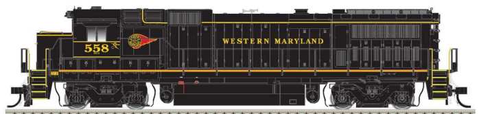
Western Maryland Scenic Railroad † † paint scheme appropriate for locomotive of similar prototype (front and rear ditch lights)