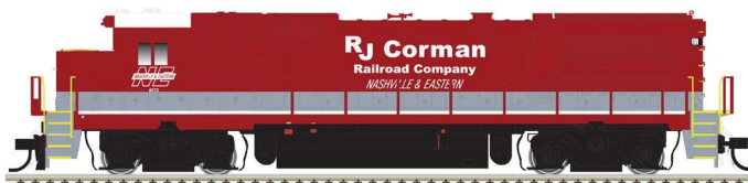
RJ Corman (front and rear ditch lights)