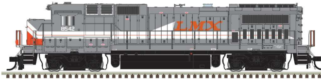
LMX (General Electric Leasing) (front ditch lights)