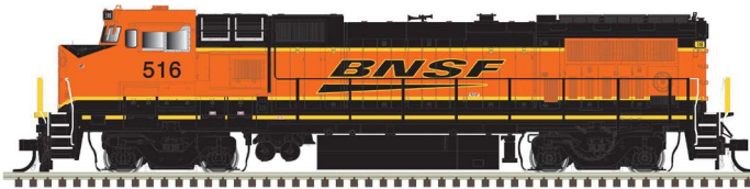
BNSF (Wabtec Rebuild)