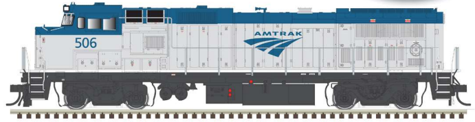
Amtrak® Phase V Officially licensed by Amtrak®