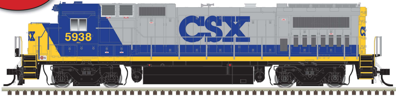
CSX* (YN2) (front ditch lights)