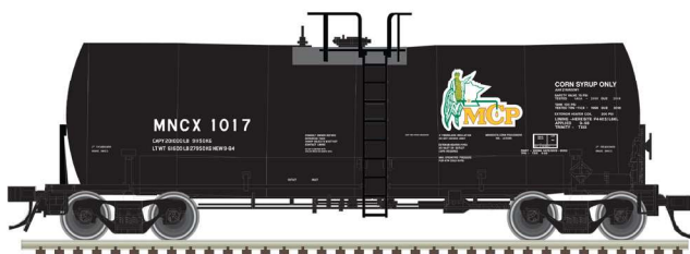
Minnesota Corn Processors (MNCX)