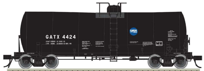
GATX (Service Driven)