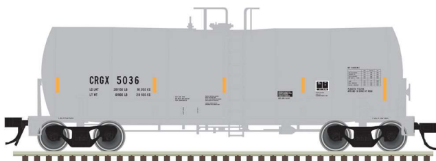
Cargill (UTCI repaint)