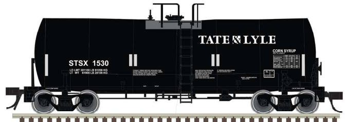
Tate & Lyle