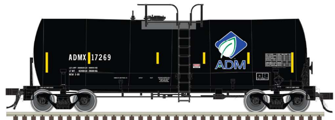
ADM (Leaf & Conspicuity Stripes)