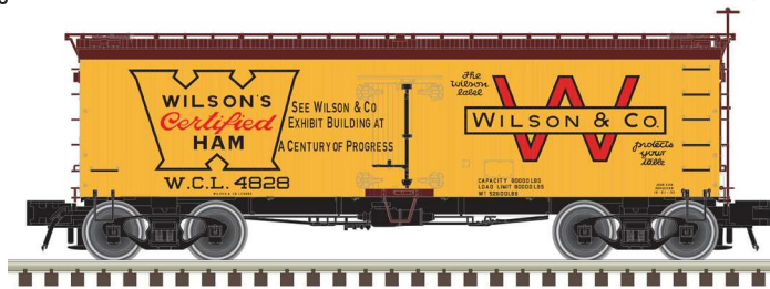
Wilson Packing Certified Ham