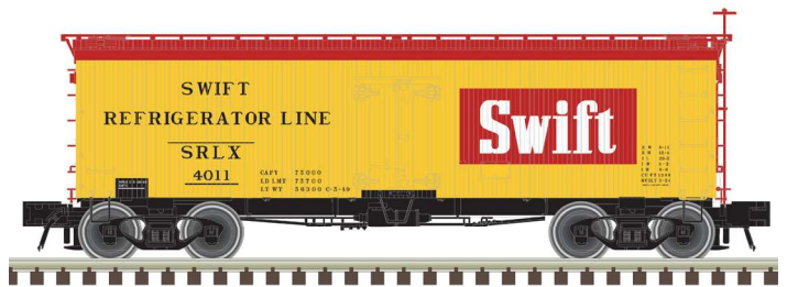
Swift (1949 Scheme)