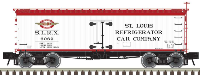
St. Louis Refrigerator Car Co.