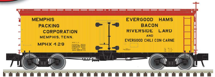
Memphis Packing Corporation