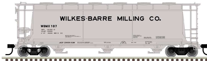
Wilkes-Barre Milling Co.