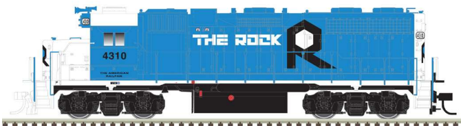
Rock Island Rail 4310 (front and rear ditch lights)