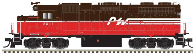
Providence & Worcester (front and rear ditch lights)