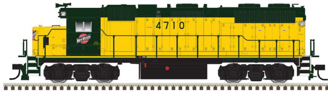
Chicago & North Western