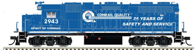
Conrail (Spirit of Conrail) (front and rear ditch lights)