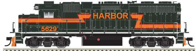
Indiana Harbor Belt (front and rear ditch lights)