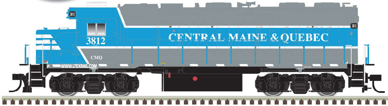
Central Maine & Quebec Railway (front and rear ditch lights)