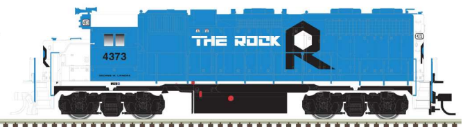
Rock Island Rail 4373 (front and rear ditch lights)