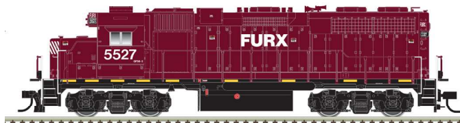
FURX (front and rear ditch lights)