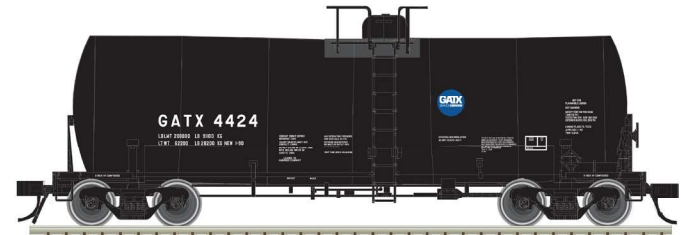
GATX (Service Driven)