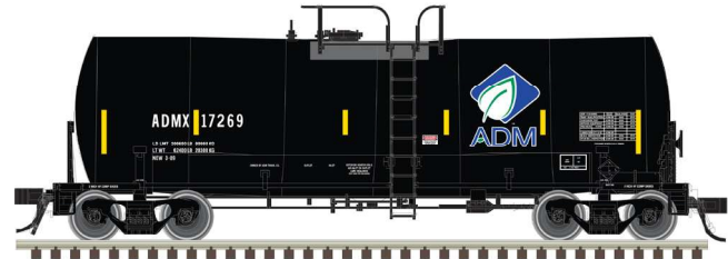
ADM (Leaf & Conspicuity Stripes)