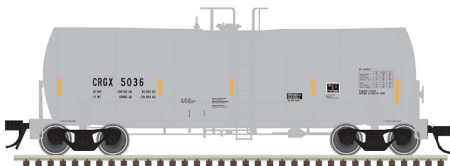
Cargill (UTCI repaint)