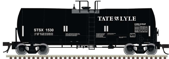
Tate & Lyle