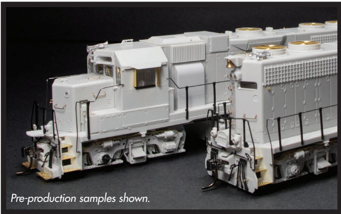
Pre-production samples shown.