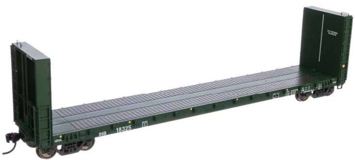
Indiana Harbor Belt 920-104357 #18325 920-104358 #18335 920-104359 #18348