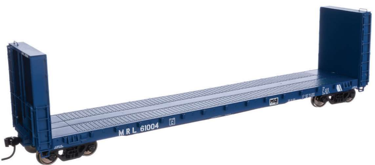
Montana Rail Link 920-104360 #61004 920-104361 #61028 920-104362 #61045