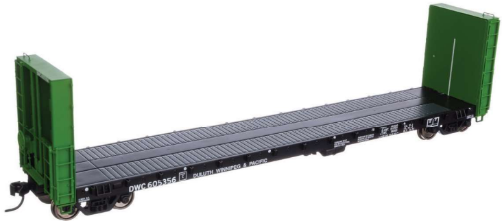
Duluth, Winnipeg & Pacific - DWC 920-104354 #605356 920-104355 #605370 920-104356 #605386