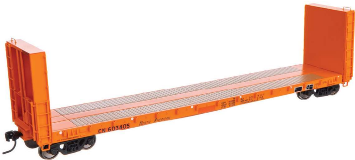
Canadian National - Orange 920-104351 #603405 920-104352 #603409 920-104353 #603417

LIMITED QUANTITY ONE TIME RUN OF THESE ROADNUMBERS ORDER NOW