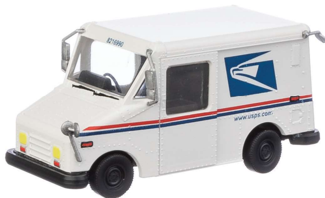
USPS® Modern LLV 949-12253

NEWLY TOOLED OFFICIALLY LICENSED REPLICA!