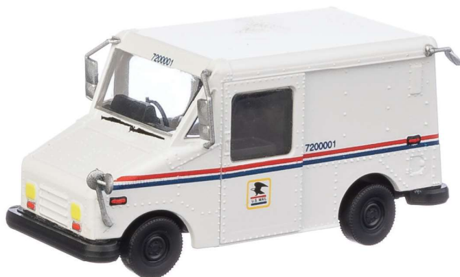
USPS® Vintage LLV 949-12251