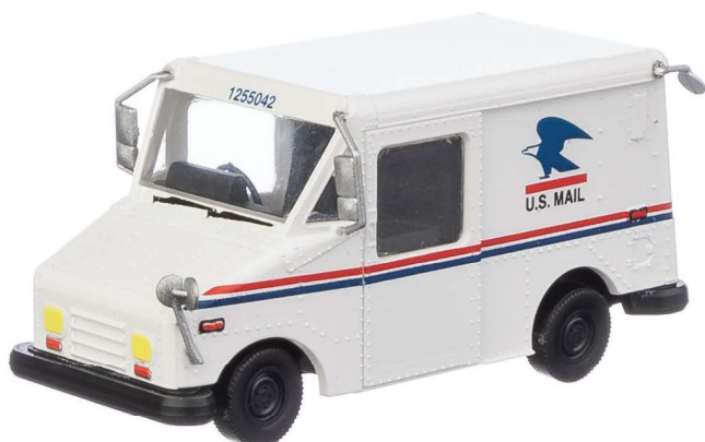
USPS® 1980s LLV 949-12252