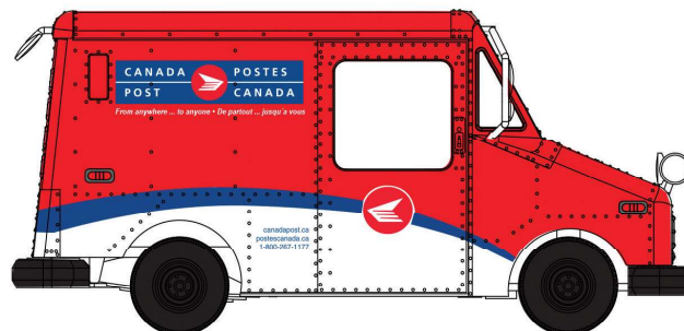
Canada Post (1998 - present) 949-12255