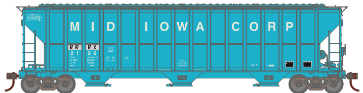
Era: Late 1990s+