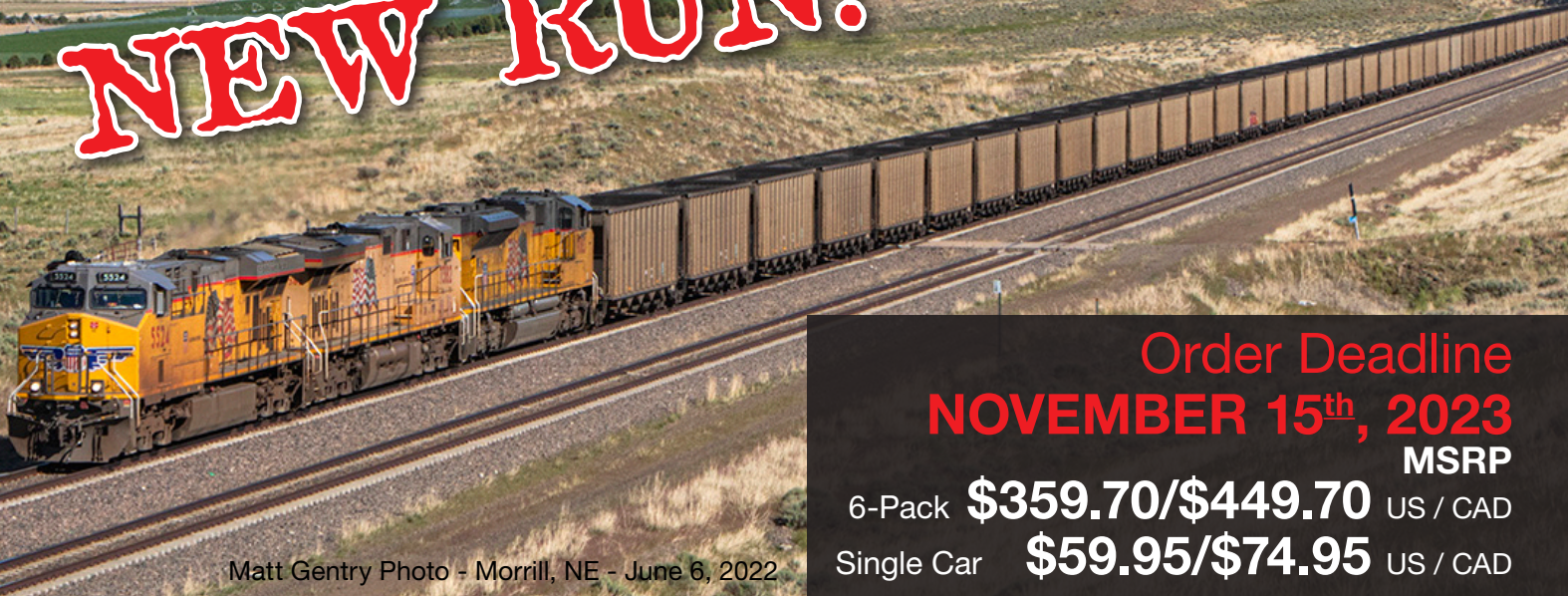
Morrill, NE - June 6, 2022