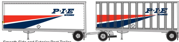
Smooth Side and Exterior Post Trailer