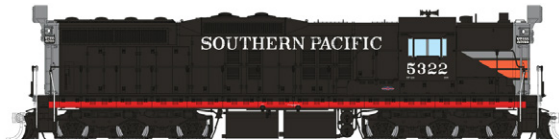
PRELIMINARY ARTWORK AND DRAWINGS. SUBJECT TO CHANGES OR REVISIONS BEFORE PRODUCTION.