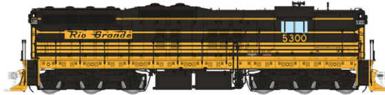
PRELIMINARY ARTWORK AND DRAWINGS. SUBJECT TO CHANGES OR REVISIONS BEFORE PRODUCTION.