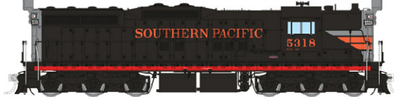
PRELIMINARY ARTWORK AND DRAWINGS. SUBJECT TO CHANGES OR REVISIONS BEFORE PRODUCTION.