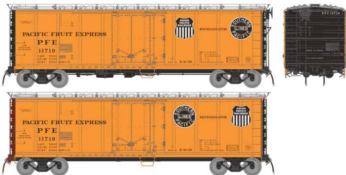
HO PFE R-40-28 Reefer 1957 Scheme