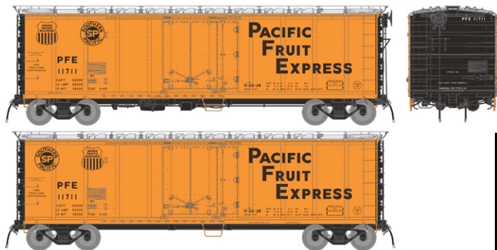
HO PFE R-40-28 Reefer 1961 Scheme