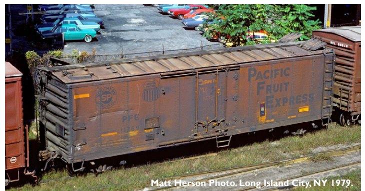
Long Island City, NY 1979.