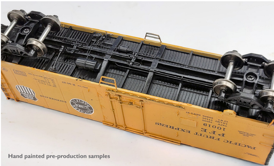
Hand painted pre-production samples