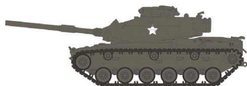
M60A1 - US ARMY

For a detailed history of these cars, check out the DODX Flatcar page on our website.