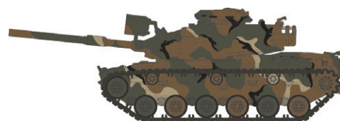
M60A1 - MERDC Winter

Item # 804002 - Single Tank $49.95 USD — $59.95 CAD