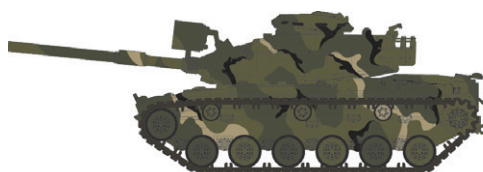
M60A1 - MERDC Summer

Item # 804001 - Single Tank $43.95 USD — $53.95 CAD