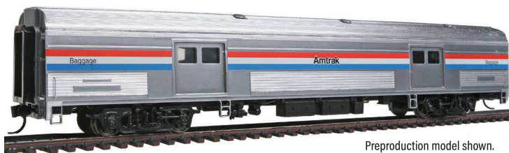
Preproduction model shown.