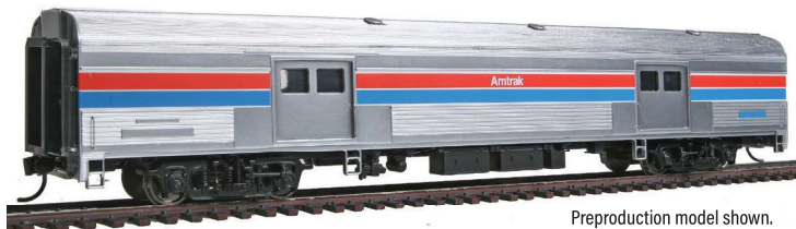
Preproduction model shown.