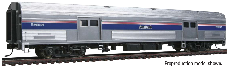
Preproduction model shown.