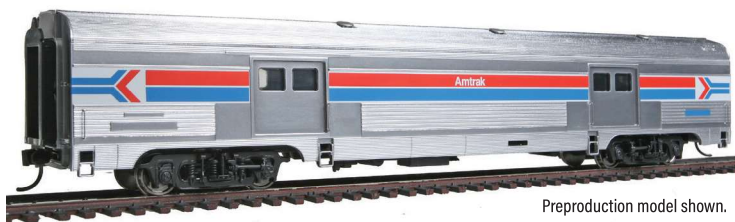
Preproduction model shown.