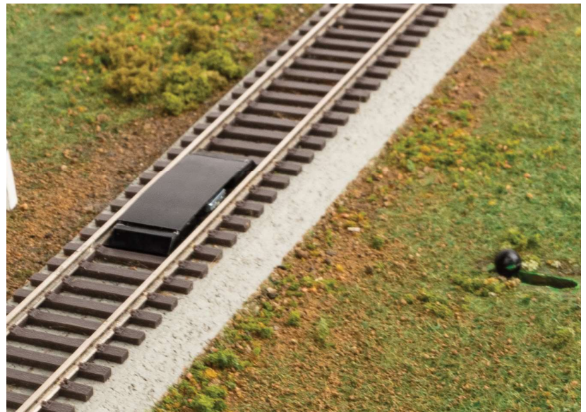
Uncoupler shown with optional cover.