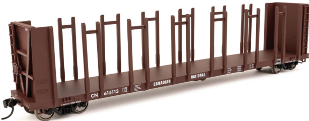
Canadian National 910-50801 #615113 910-50802 #615138 910-50803 #615242

LIMITED QUANTITY ONE TIME RUN OF THESE ROADNUMBERS ORDER NOW