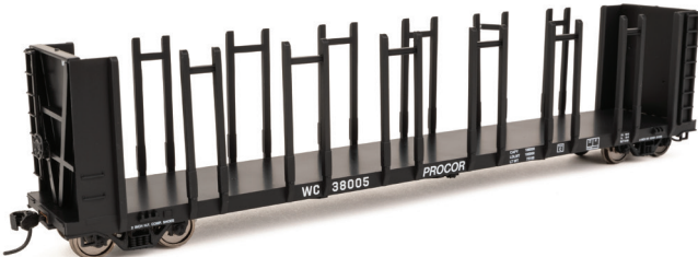
Wisconsin Central 910-50819 #38005 910-50820 #38031 910-50821 #38024