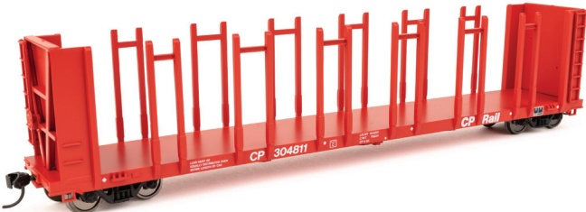
Canadian Pacific 910-50804 #304811 910-50805 #304837 910-50806 #304873