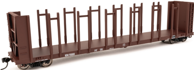
Southern 910-50810 #115555 910-50811 #115568 910-50812 #115589