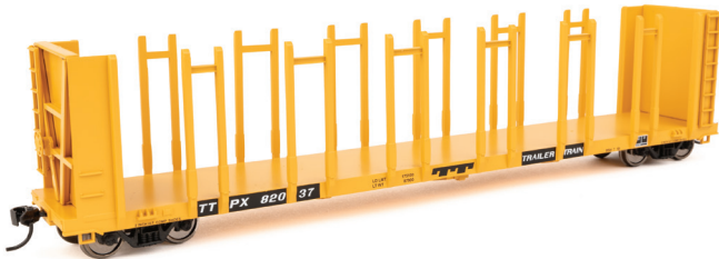
TTX TTPX 910-50813 #82037 910-50814 #82044 910-50815 #82069