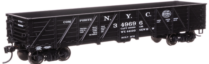
New York Central