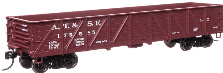
Atchison, Topeka & Santa Fe