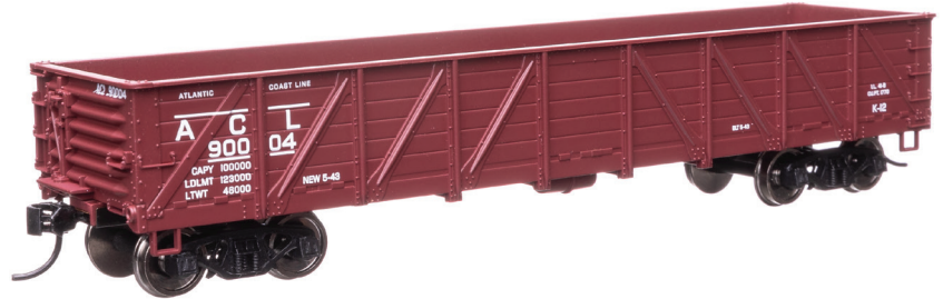
Atlantic Coast Line