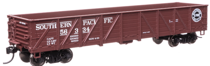
Southern Pacific †